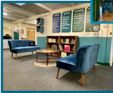
The Cosy Corner in Key Stage Two