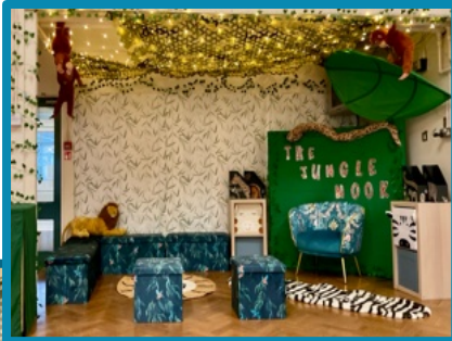
The Jungle Nook in Key Stage One

Do you have any high-quality books at home that you no longer need or read? Our PTA would love any donations that you have for their book sale taking place next week, on World Book Day. The sale will take place in the junior hall from 3.20pm.