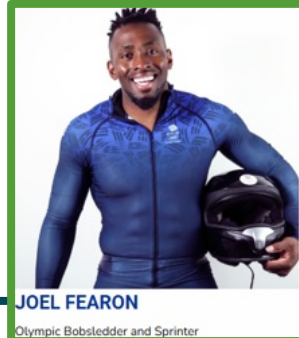
JOEL FEARON Olympic Bobsledder and Sprinter